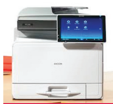
B&W Print: 30 to 40 pages per minute Resolution: 1200 dpi (print), 600 dpi (copy), 600 dpi (scan)

B&W Print: 25 to 60 pages per minute Resolution: 1200 dpi (print), 600 dpi (copy), 600 dpi (scan)